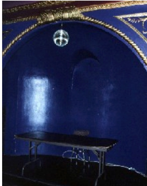
The area where bodies were once laid out is currently the stage for bands.