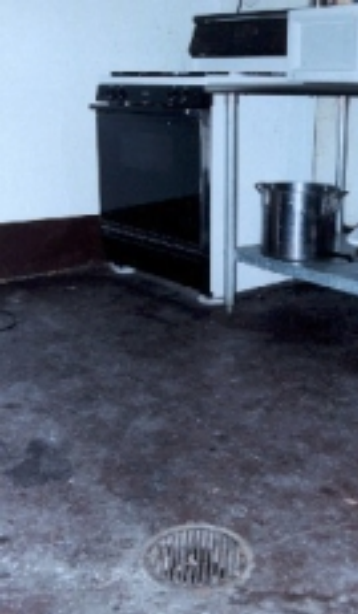
The current kitchen used to be where bodies were embalmed, as evidenced by the floor drain.